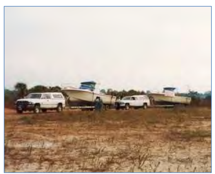
Photo showing the two Good Go TE283 boats, representing Heavenly Fortune, arrived in Jardim in December 1997